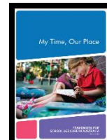
My Time, Our Place; Framework for School Age Care in Australia 2022 V2