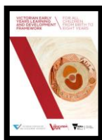
Victorian Early Years Learning and Development Framework

Approved learning framework: a guide which provides a vision for learning, pedagogical principles, practices and general goals or outcomes for children’s learning and how they might be attained. It provides a scaffold to assist educators to develop their own, more detailed curriculum relevant to their setting and the children and families attending. The Early Years Learning Framework V2 (Belonging, Being & Becoming) , the Victorian Early Years Learning and Development Framework and My Time, Our Place V2; Framework for School Age Care in Australia are approved learning frameworks for use in Victoria ( refer to Sources ).